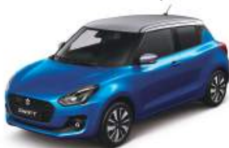
Speedy Blue/Premium Silver