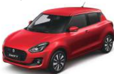
Burning Red Pearl Metallic