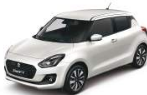
Pure White Pearl