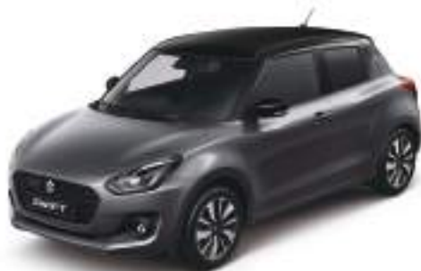
Mineral Grey/Super Black