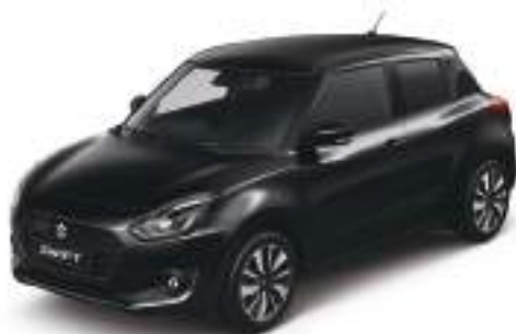
Super Black Pearl