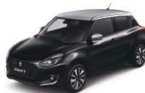
Super Black/Premium Silver