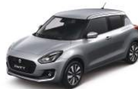
Premium Silver Metallic