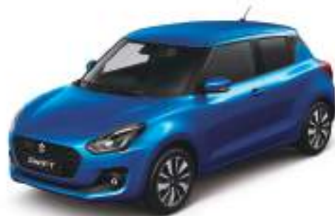
Speedy Blue Metallic