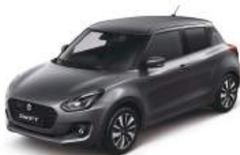
Mineral Grey Metallic